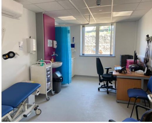
Typical Consulting Room