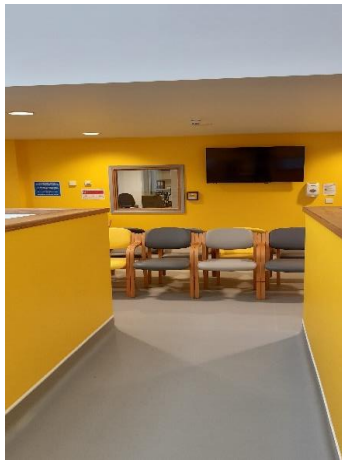
1st Floor Waiting Area